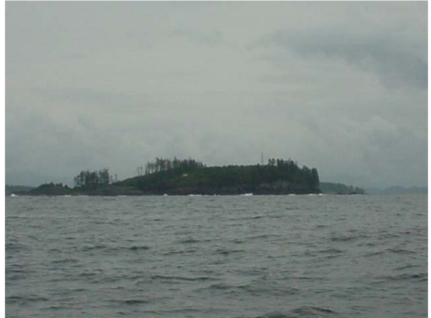
Famous Egg Island, the outermost point in the Pacific when rounding Cape Caution.