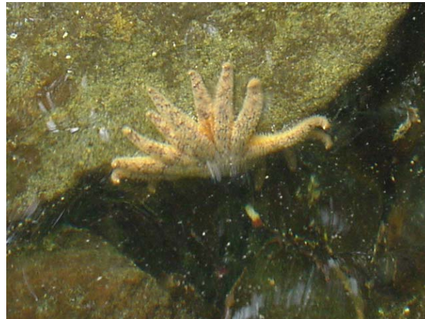
"Teenage" Sunstar (they grow to 2-3 feet in diameter)