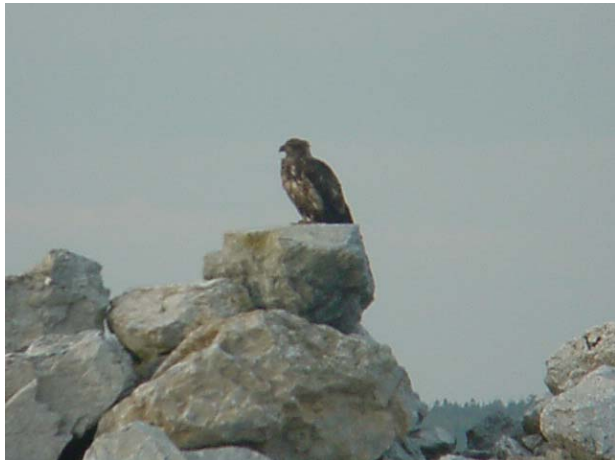
Golden Eagle (others thought it was a young Bald Eagle)